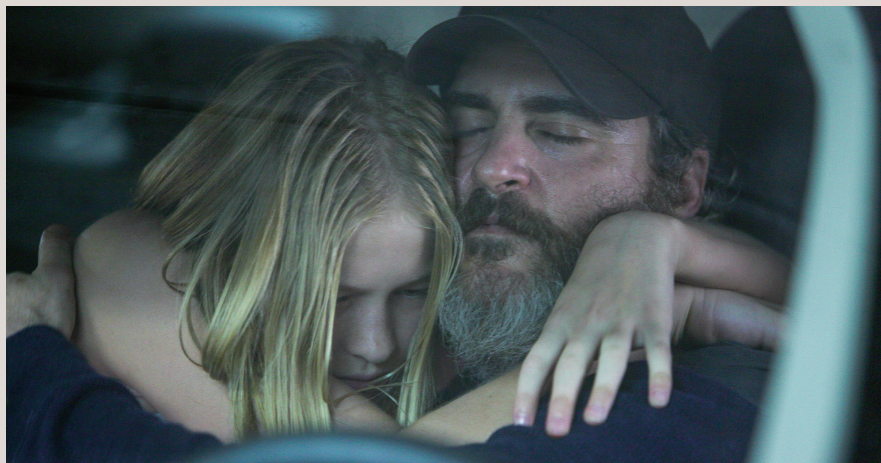
致受傷的靈魂：琳恩倫賽 A Crack in the Soul: Lynne Ramsay