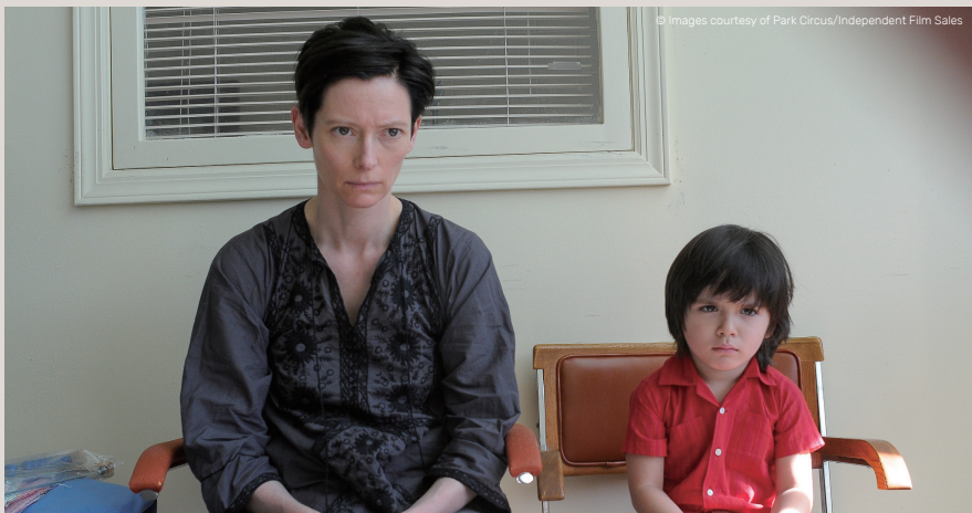
致受傷的靈魂：琳恩倫賽 A Crack in the Soul: Lynne Ramsay